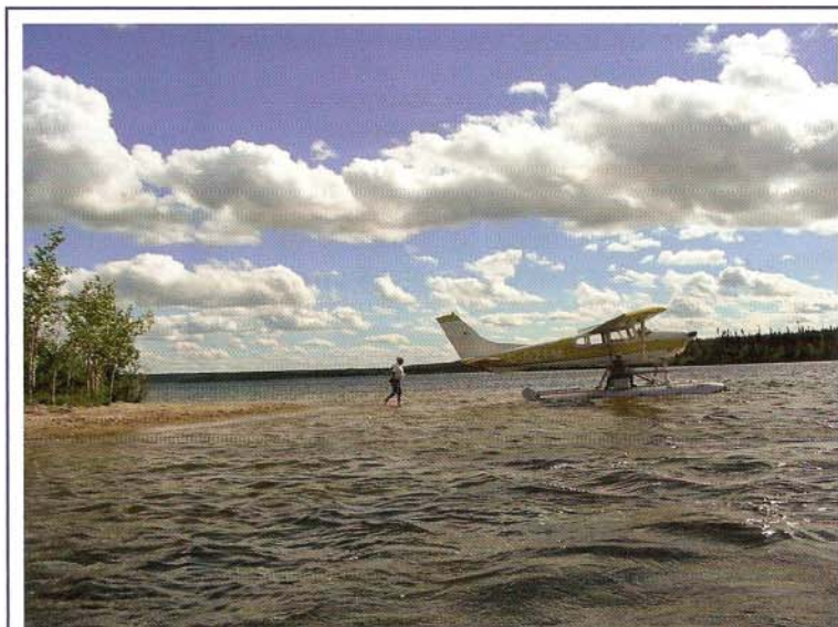
"Sealane" on Hawley Lake in Ontario, Canada.

Citabria on floats, in 1973, for $17,000.00 each, to lease to the club! Altogether, the club operated more than a dozen aircraft and had more than 100 members!"