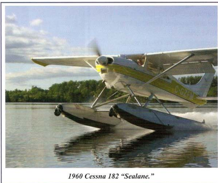
1960 Cessna 182 "Sealane."